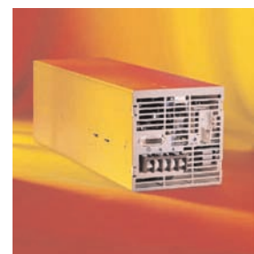
5" x 5" x 15.5" Up to 8100W DC Bus Bars AC Terminal Block Option Connector DB25