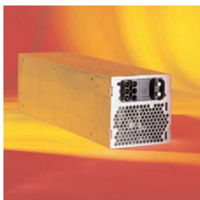
5" x 5" x 17" Up to 5000W Elcon Top Drawer Hot Plug Connector

OVER VOLTAGE PROTECTION: 125% \pm 5\% of nominal. OVP shutdown is latched until the input line is removed for 30 seconds and then reapplied. OVP sensing is done at the output terminals. OVER CURRENT PROTECTION: Current Limit Point: 110% to 120% of full load. SHORT CIRCUIT CURRENT: Fold back type to 40%-80% of full rated current. Unit will recover when overload is removed. REVERSE VOLTAGE PROTECTION: Protected to rated load with the fan running. OVER TEMPERATURE PROTECTION: The unit automatically shuts down in the event of an over temperature condition. After cool down, power must be recycled to restart unit. Optionally, non-latchable protection is also available.