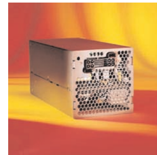
5" x 5" x 11.5" Up to 3000W Elcon lower Drawer Hot Plug Connector

Note: Refer to Section 26 for list of all standard options