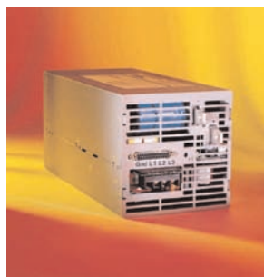
5" x 5" x 11.25" Up to 3000W DC Bus Bars AC Terminal Block Option Connector DB25